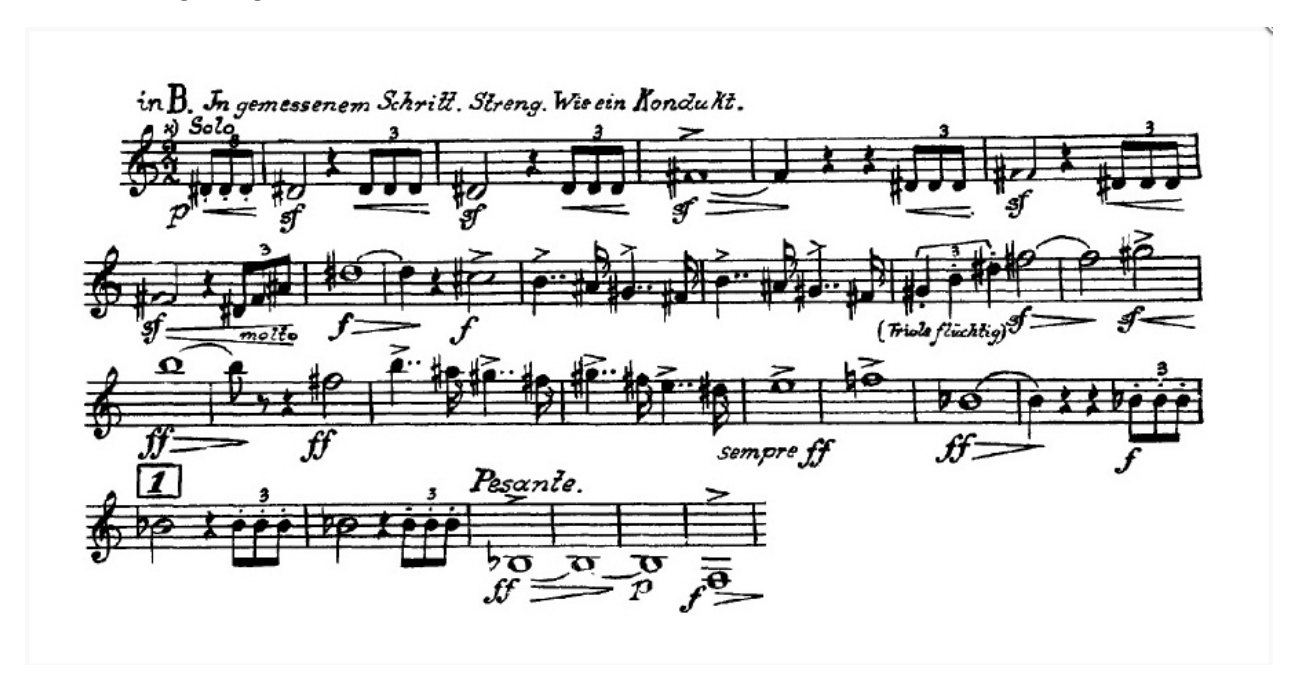
Mahler 5: Beginning – 6<sup>th</sup> measure after rehearsal 1

Stravinsky: Petrouchka – Ballerina's dance