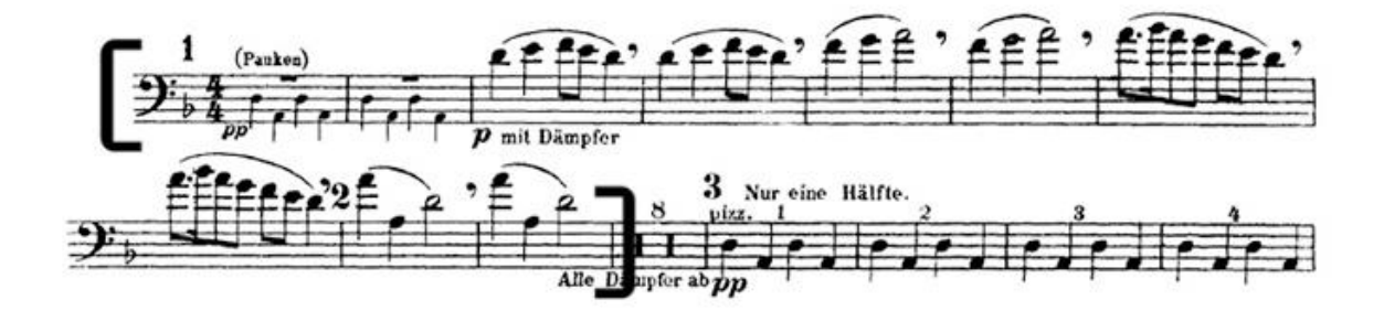
Mahler – Symphony No. 1 Mvt. 3 – m. 3-8